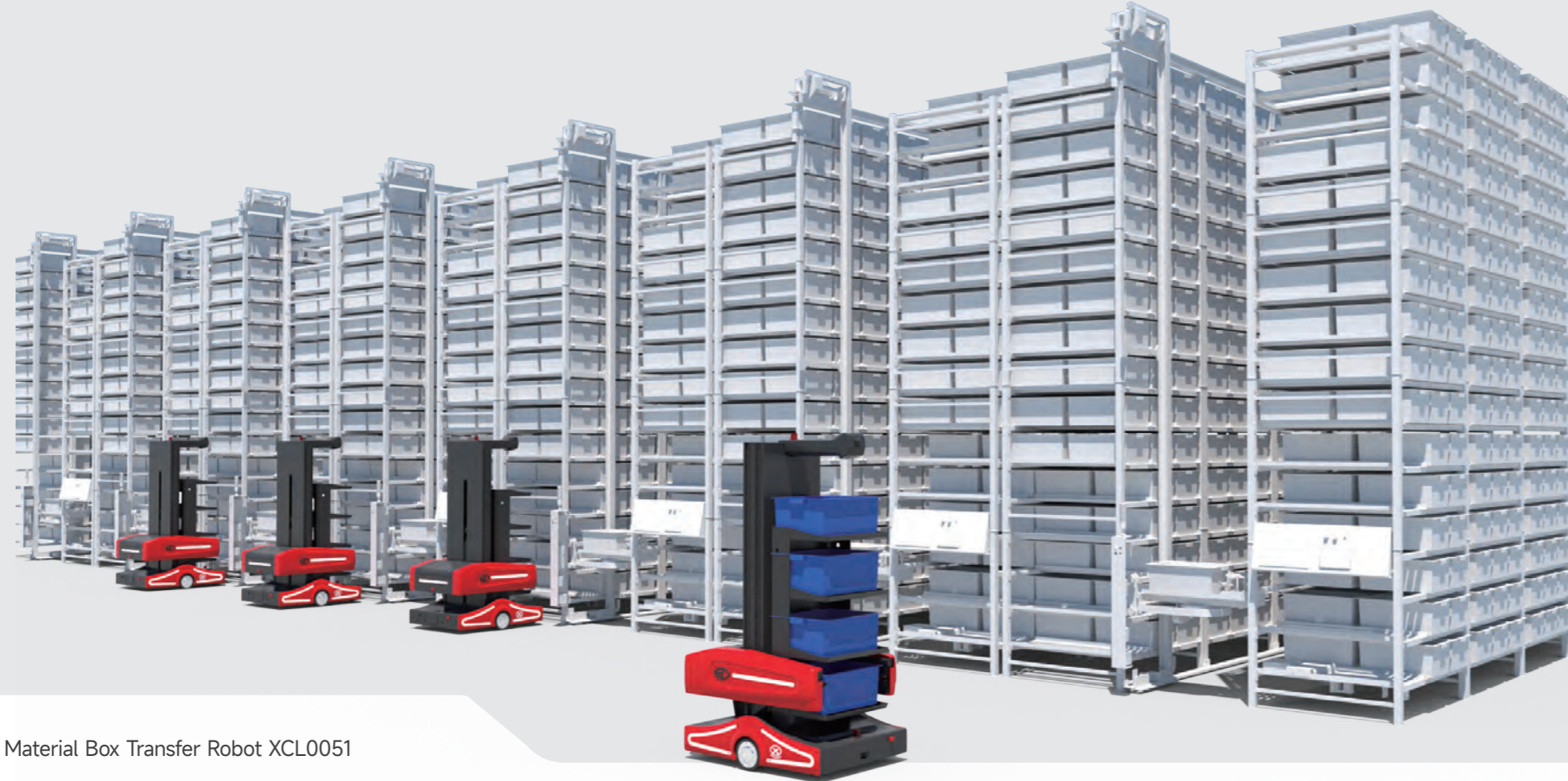
Material Box Transfer Robot XCL0051