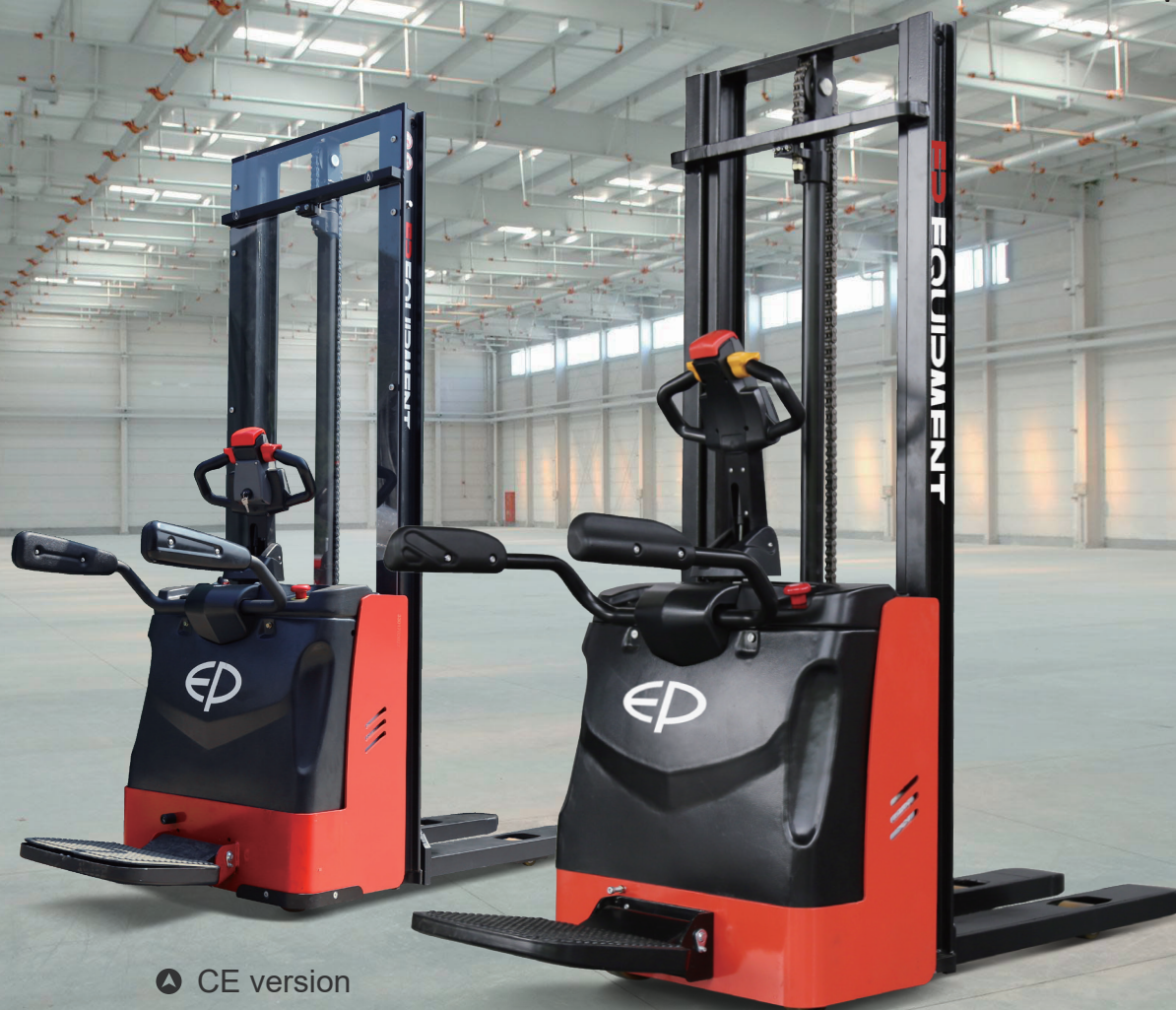
▲ CE version